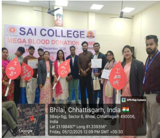
Bhilai, Chhattisgarh, India 58xq+5gj, Sector 6, Bhilai, Chhattisgarh 490006, India Lat 21.198497° Long 81.339356° Friday, 05/12/2025 12:09 PM GMT +05:30