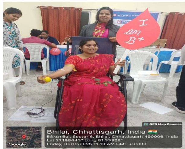
Bhilai, Chhattisgarh, India 58xq+5gj, Sector 6, Bhilai, Chhattisgarh 490006, India Lat 21.198443° Long 81.33929° Friday, 05/12/2025 11:10 AM GMT +05:30