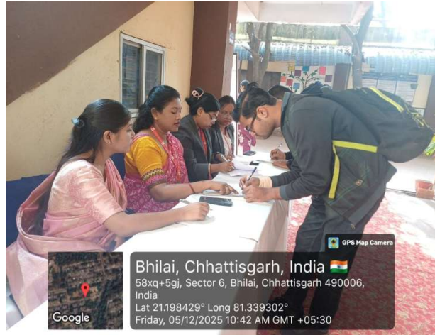
Bhilai, Chhattisgarh, India 58xq+5gj, Sector 6, Bhilai, Chhattisgarh 490006, India Lat 21.198429° Long 81.339302° Friday, 05/12/2025 10:42 AM GMT +05:30