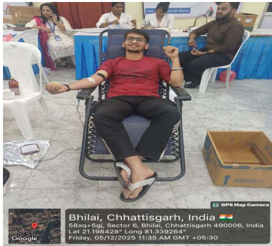
Bhilai, Chhattisgarh, India 58xq+5gj, Sector 6, Bhilai, Chhattisgarh 490006, India Lat 21.198426° Long 81.339264° Friday, 05/12/2025 11:36 AM GMT +05:30